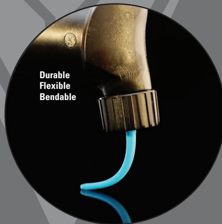
Durable Flexible Bendable

Flexible. Bendable. Durable, will not break when inflating sports balls. Highest quality and technologically advanced materials. Oil-injected plastic preserves rubber seal on sports balls. Use activates special lubrication in the needle for easy functionality and preservation of sports balls. Fluorescent colors stand out in every environment. US Patent D740328 USA