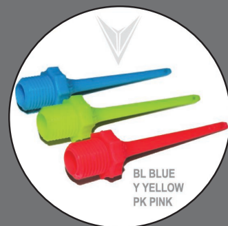
BL BLUE Y YELLOW PK PINK